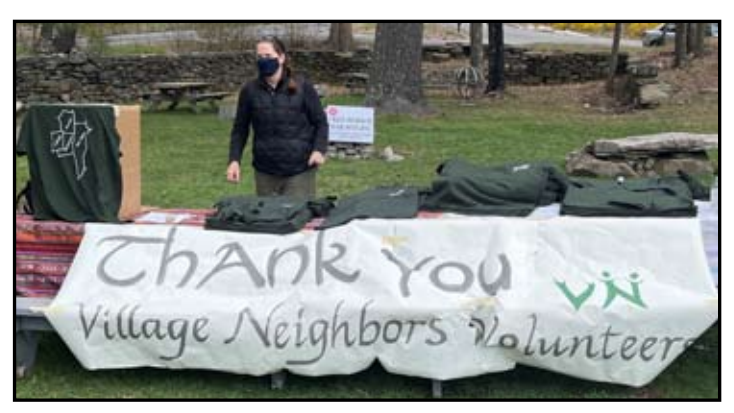
VN Volunteer Appreciaition Day 2021

Your Invited to join us for free food and music at our annual Village Neighbors Volunteer Appreciation event. We hope our members will attend as well, this is an opportunity to thank the volunteers who work so hard for you, our Village Neighbor members.